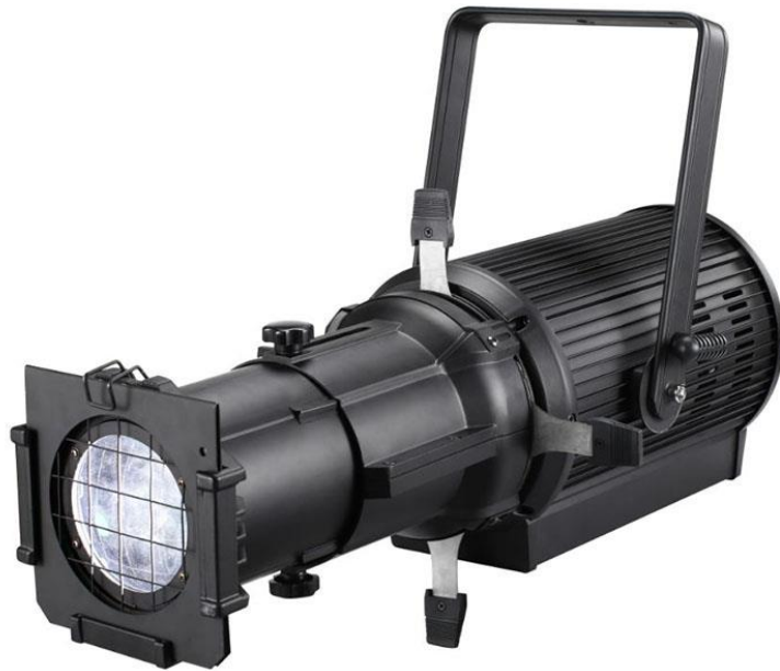
Model: BC-LE300 300w Leko Spot Profile Light